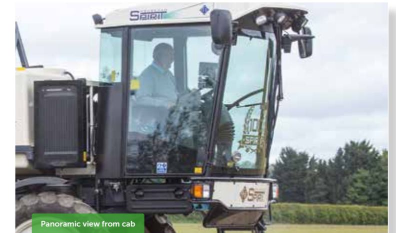
Panoramic view from cab

Quiet running, with reassuringly solid stability thanks to the well-balanced boom and a near-perfect 50/50 centre of gravity, the SPIRIT is a joy to work with. Easy-to-use controls within the superbly appointed, ergonomic cab are all positioned just where you'd want them to be and panoramic vision gives a good view of the boom at all times.