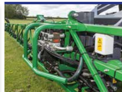
Pantograph arms ensure precise spraying height