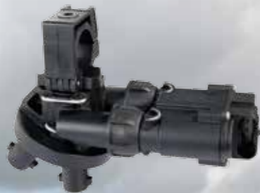
Dual or quad nozzle set-ups reduce boom pressure and drift