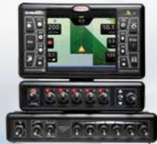
Continuous real-time information on valve status relayed to Bravo 400S controller via Can-Bus.

The SPIRIT is available with Seletron - a cutting-edge electronic shut-off nozzle valve that, applied to ARAG nozzle holders and integrated with the GPS-linked Bravo 400S controller, allows the separate control of every single nozzle in up to 13 boom sections. The system automatically shuts off each individual nozzle to avoid spray overlap and selects the most suitable nozzle according to spray rate and speed, maximising spraying precision and minimising waste.