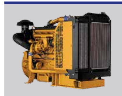
Easy-access CAT engine power pack is rear-mounted for a quieter cab