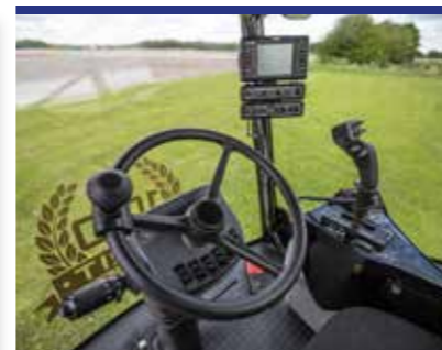
Air conditioned, ergonomically designed cab with user-friendly layout and controls, radio, CD and fold-down buddy seat