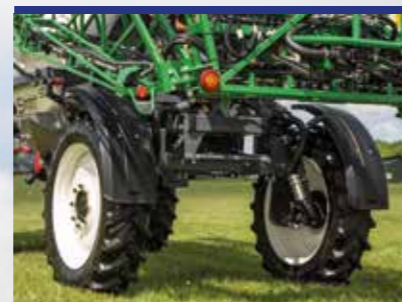
High ground clearance