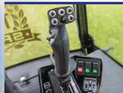
Easy operation of spray functions from spray control unit