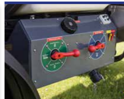
Plumbing system designed for easy filling and washing out